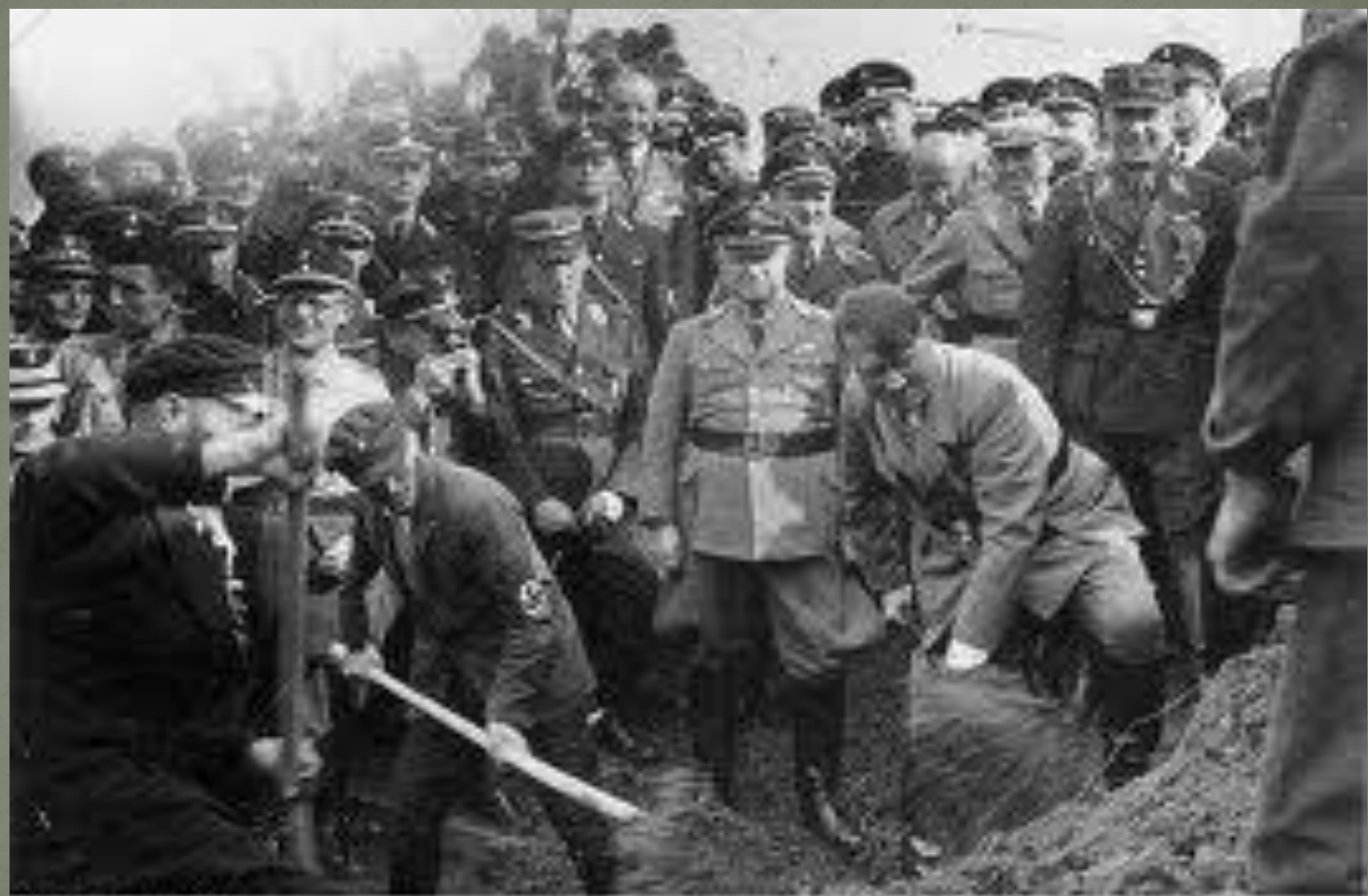
Generalissimo and staff in the trench during the September 1944