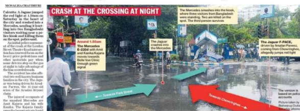
The Mercedes-Benz car that crashed into the kiosk, where three visitors from Bangladesh were standing. The car was driven by Arsalan scion. The Bangladeshi visitors were killed.

CRASH AT THE CROSSING AT NIGHT A Jaguar driven by an Arsalan scion crashed into a kiosk, killing two Bangladeshi visitors. The car was driven by Arsalan scion. The Bangladeshi visitors were killed.